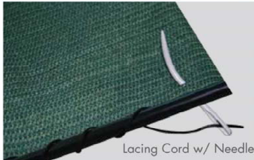
Lacing Cord w/ Needle